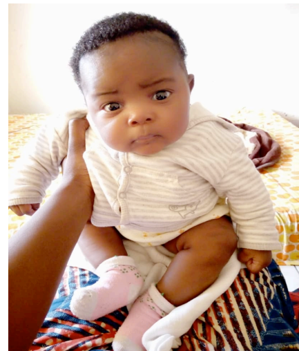
Survivors with her baby out of rape