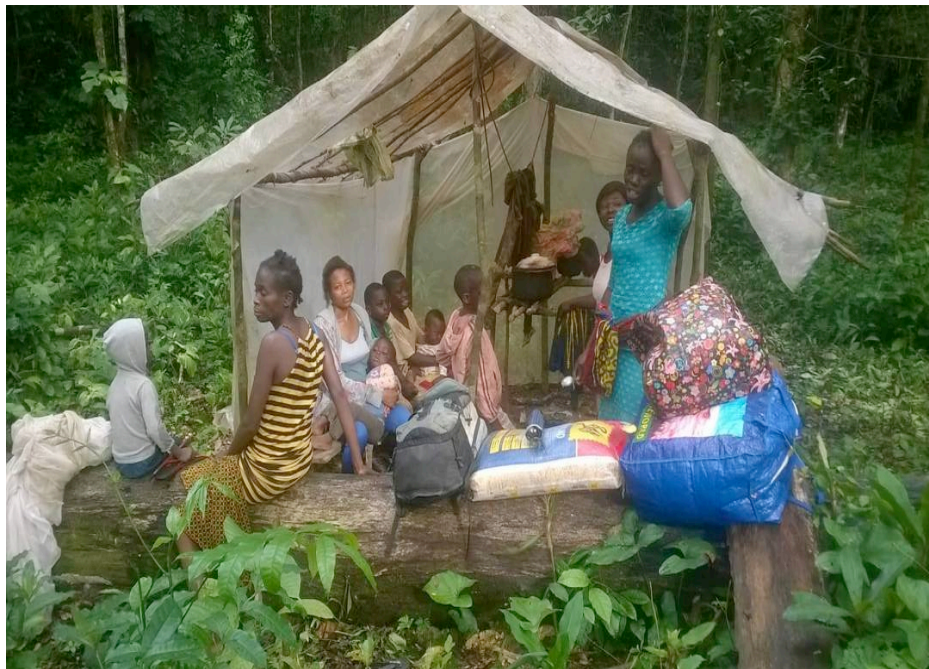
Women and Children take refuge in a farm as they flee Armed Conflict in the South West Region of Cameroon

Most of the internally displaced persons (IDPs) from the two conflict regions of South West and North West are in and around the outskirts of the two biggest cities of Yaoundé and Douala. Having fled from their communities due to armed conflict, and after over four (04) years, they have very little or no means of livelihoods. They are abused and exploited by their host communities for labour, street vending and sexual violence. Many have no jobs and no source of livelihood. The women and girls are sexually abused and exploited and sometimes engage in survival sex and sometimes rape, while the youths are exploited for labour often with little or no pay.