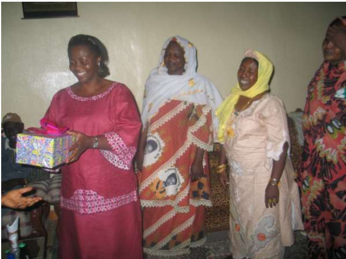
The president of Mitchetere Group and SOW Teachers handing gifts to CYJULERC TEAM in appreciation of the SOW programme in their community

The general response of the population to the school on wheels programme is very encouraging and more communities are beginning to understand the importance of education. CYJULERC has employed a teacher of the Teachers Training College on part-time basis to assist the Kousserie Regional Coordinator with the supervision and monitoring of the programme and activities as such we are able to meet the demand of the programme by the communities. It worth noting that CYJULERC also benefits from technical, financial and moral assistance from the Divisional Delegation of Women's Empowerment and the Family; and the City Council of Kousserie to ensure the success of the SOW programme.