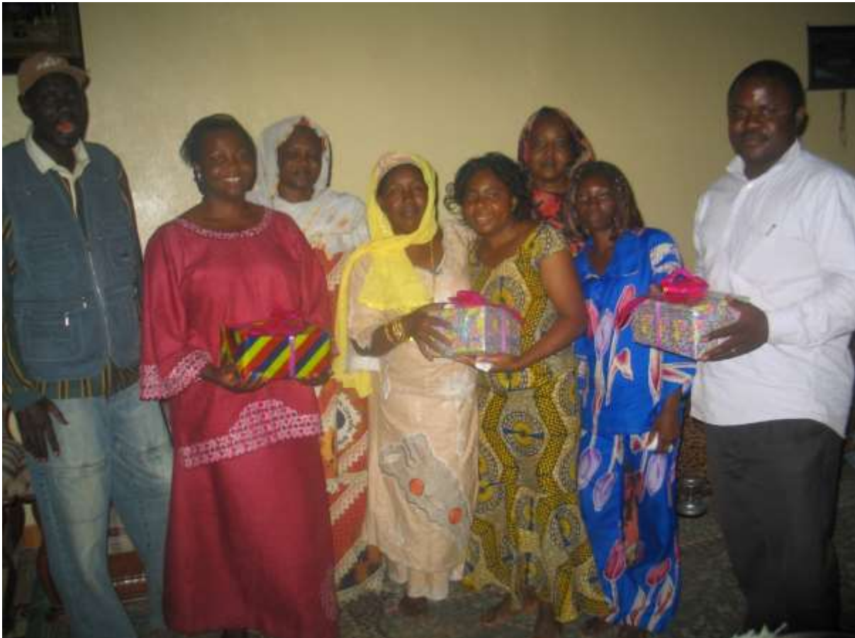
The president of Mitchetere group and SOW Teachers handing gifts to CYJULERC Team in appreciation of the program

SUPPORTED BY: MIVA/OneMen The Netherlands