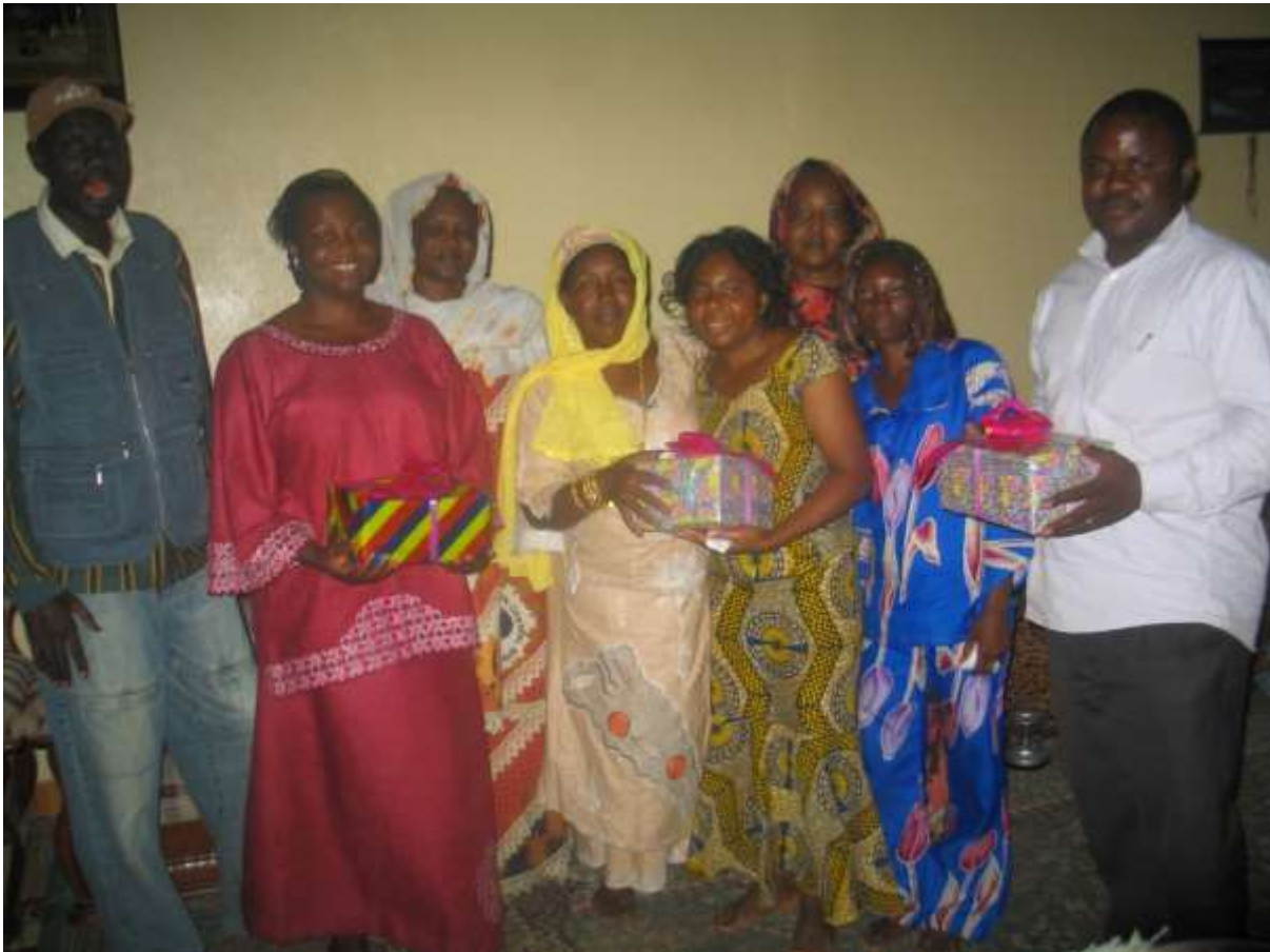
The president of Mitchetere group and SOW Teachers handing gifts to CYJULERC Team in appreciation of the program

SUPPORTED BY: MIVA/OneMen The Netherlands